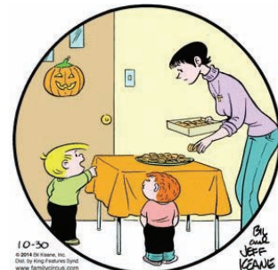
10-30 © 2014 by Keane, Inc. All Rights Reserved www.familygrouse.com "If you're wondering whether the kids will like that candy, I could taste-test it for you."